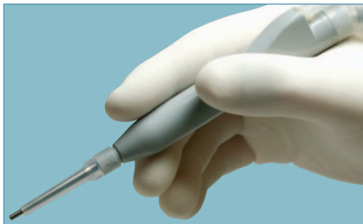
New slim profile handpieces are capable of simultaneously providing ultrasonics and coagulation function