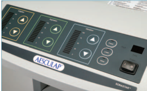
Modern and easy-to-use control unit