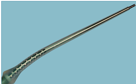
Optional long curved probe to enable deeper access and support minimally-invasive procedures.